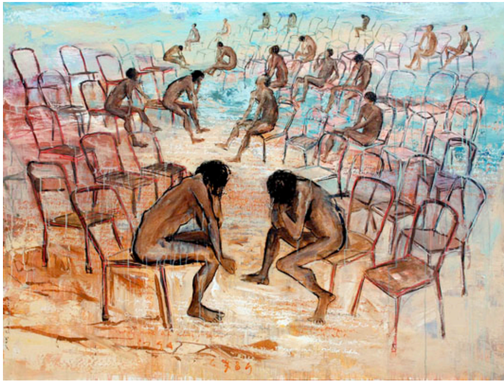
Putu Sutawijaya, Dominasi Terdominasi (Dominate Dominated) (2009) Mixed media on canvas, 59 1/2 x 74 3/4 inches