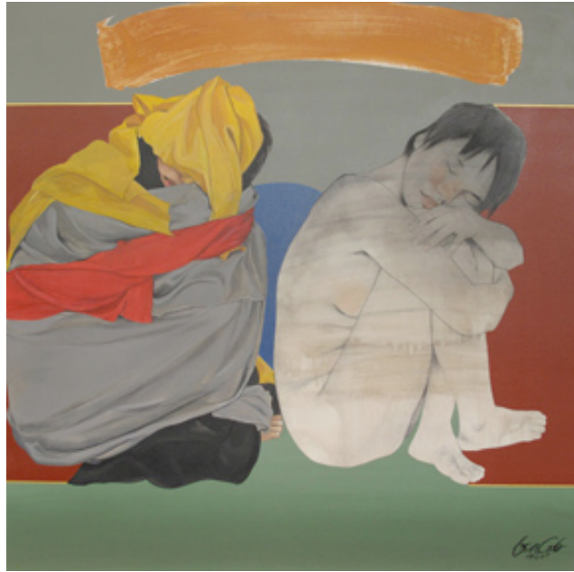
Ben Cabrera, Concealed & Revealed (2009), Acrylic on canvas, 48 x 48 inches