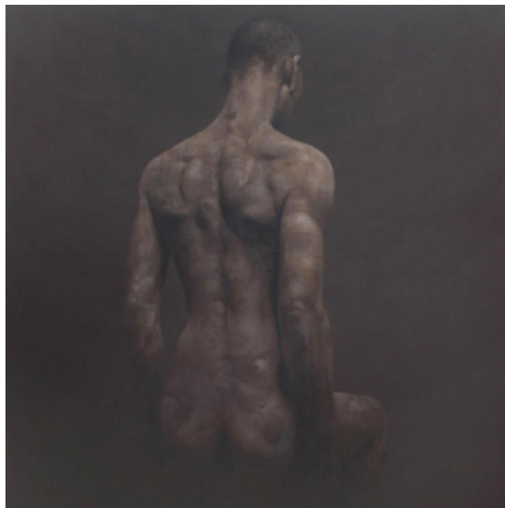
Ahmad Zakii Anwar, Seated Figure 11 (2009), Acrylic on jute, 54 x 54 inches