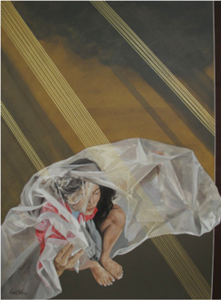
Ben Cabrera, Golden Shower (2009) Acrylic on canvas, 48 x 36 inches