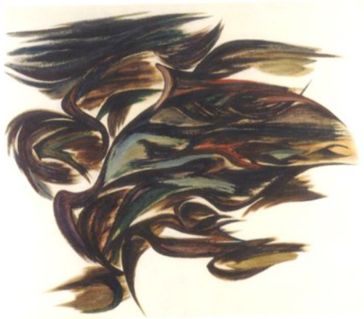
Syed Ahmad Jamal, Winter Wind , 1959