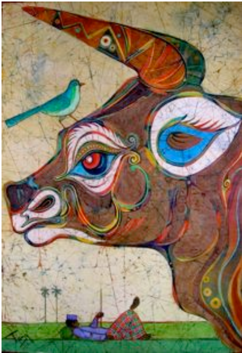
Chuah Thean Teng, Cowherd , 1985