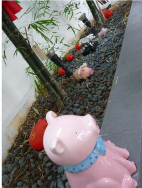
My Pig Collection